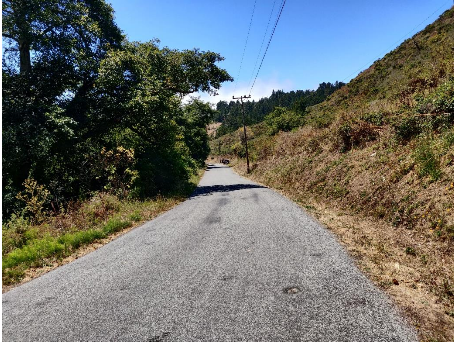
PHOTO 3: Looking west from 2801 Purisima Creek Rd, No Parking Anytime proposed along North side starting at mailbox. No Parking zone on South side except at safe pullout pictured top center