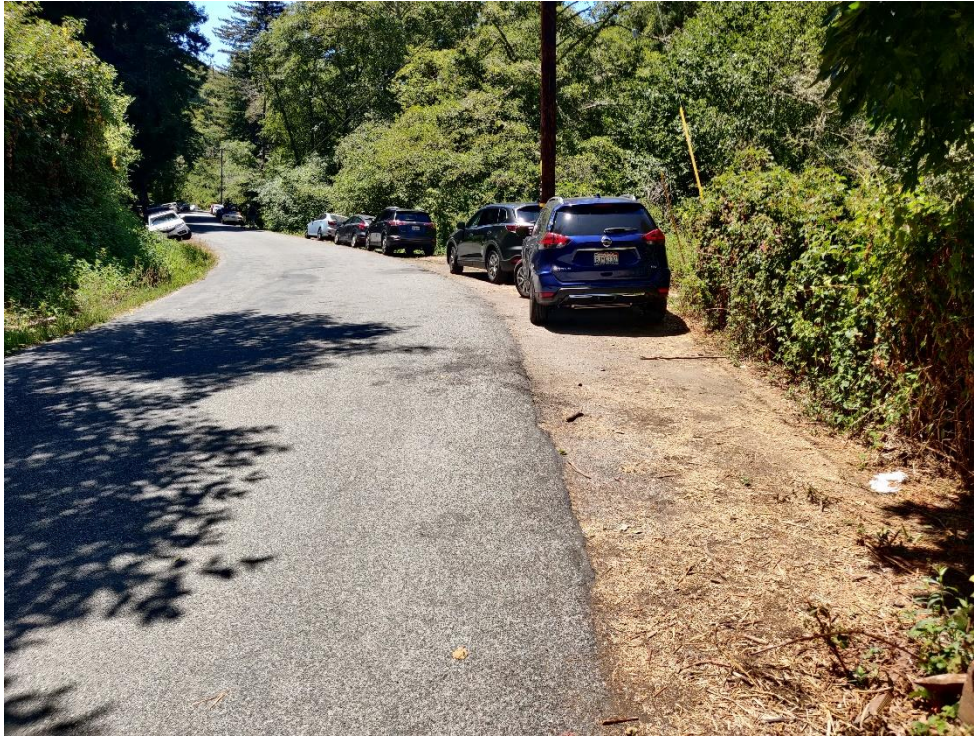
PHOTO 5: Looking east on Purisima Creek Road proposed No Parking Anytime on South side of road