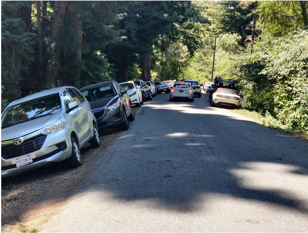
PHOTO 7: Looking west on Purisima Creek Rd, Proposed No Parking on either side at fence line