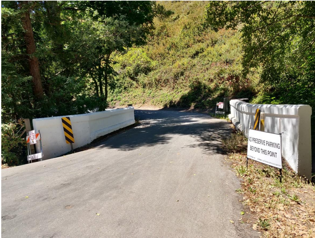
PHOTO 9: Looking east on Higgins Canyon Road back to bridge at junction with Purisima Creek Rd