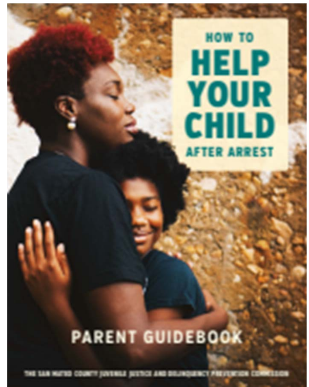
Parent Guidebook - Spanish Edition