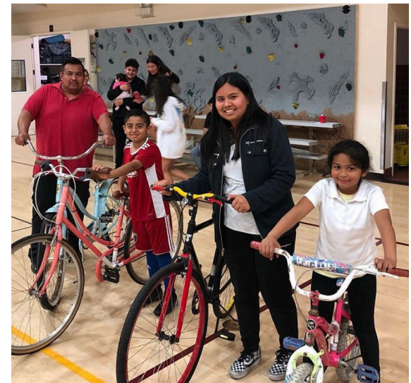
NFO Siena Y.C. Outreach Winter 2020