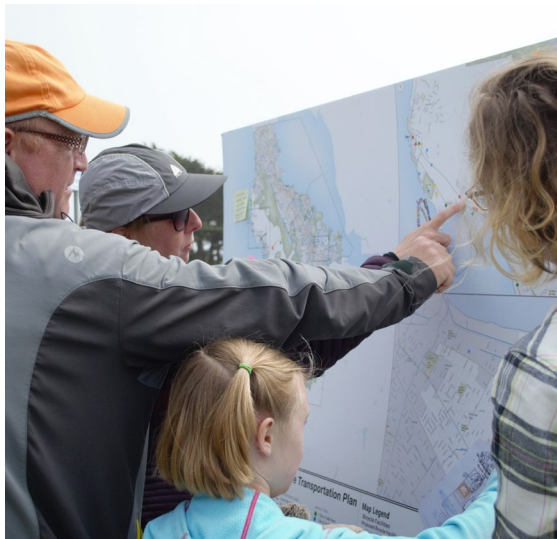
HMB Wildflower Festival Spring 2019