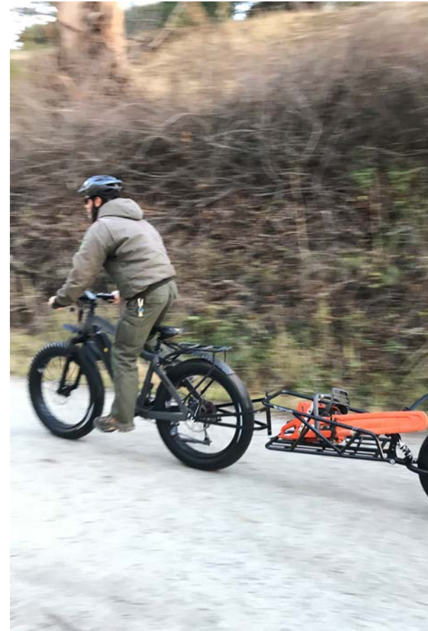
Electric bicycles for County Parks