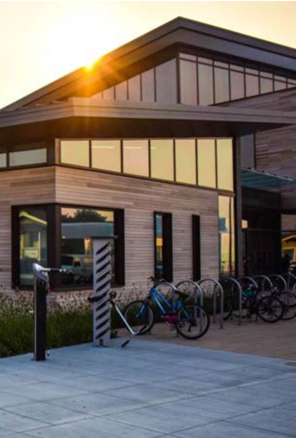
All-Electric Half Moon Bay Library