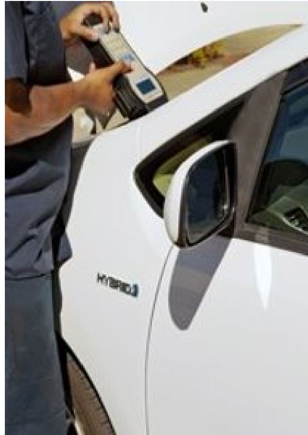
Department of Public Works staff testing a hybrid vehicle's battery