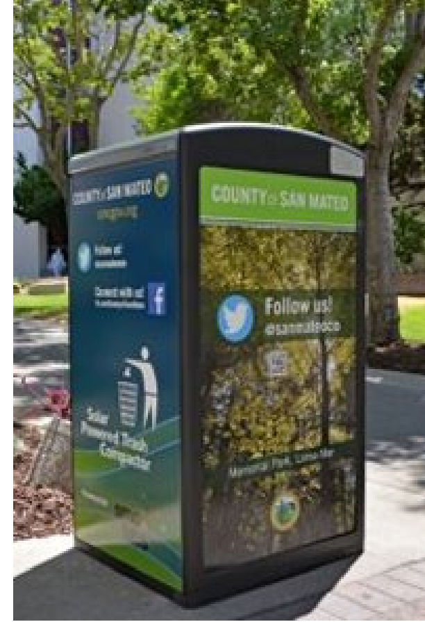
Solar powered trash compactor at County Center