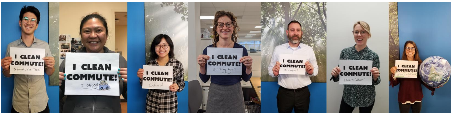
County employees sharing their excitement about participating in the Shift program