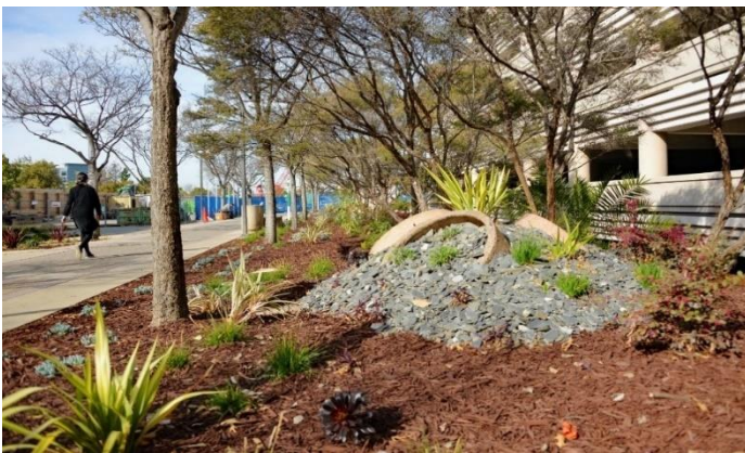
Example of water saving action through green infrastructure at County Center in Redwood City