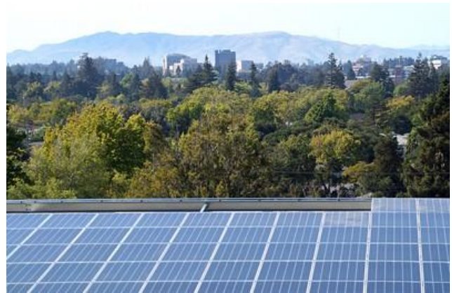
Solar array over parking at a County facility