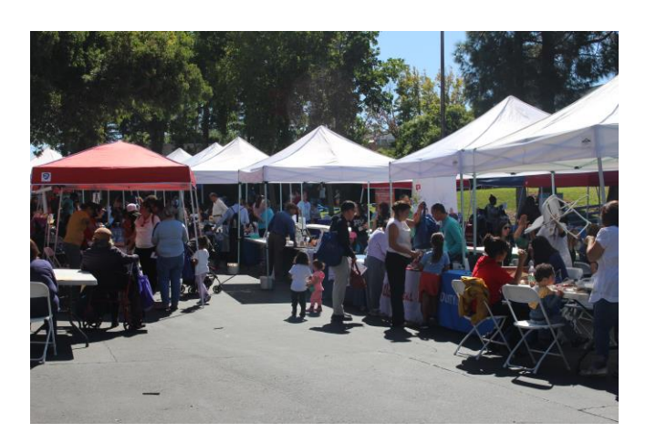
The 2019 Family, Fun, and Resource Expo!

HACSM continues to review the needs of program participants and has been expanding its partnerships with a variety of educational institutions, work force development providers, and health and social service providers. In October 2019, HACSM hosted its 7th Annual Housing & Resource EXPO. 58 partner organizations attended and met with participants, enrolled them in services such as job training and hiring services, financial training, and savings plans. There were over 70 families in attendance!