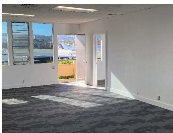
Suite 1 – Interior, facing airside