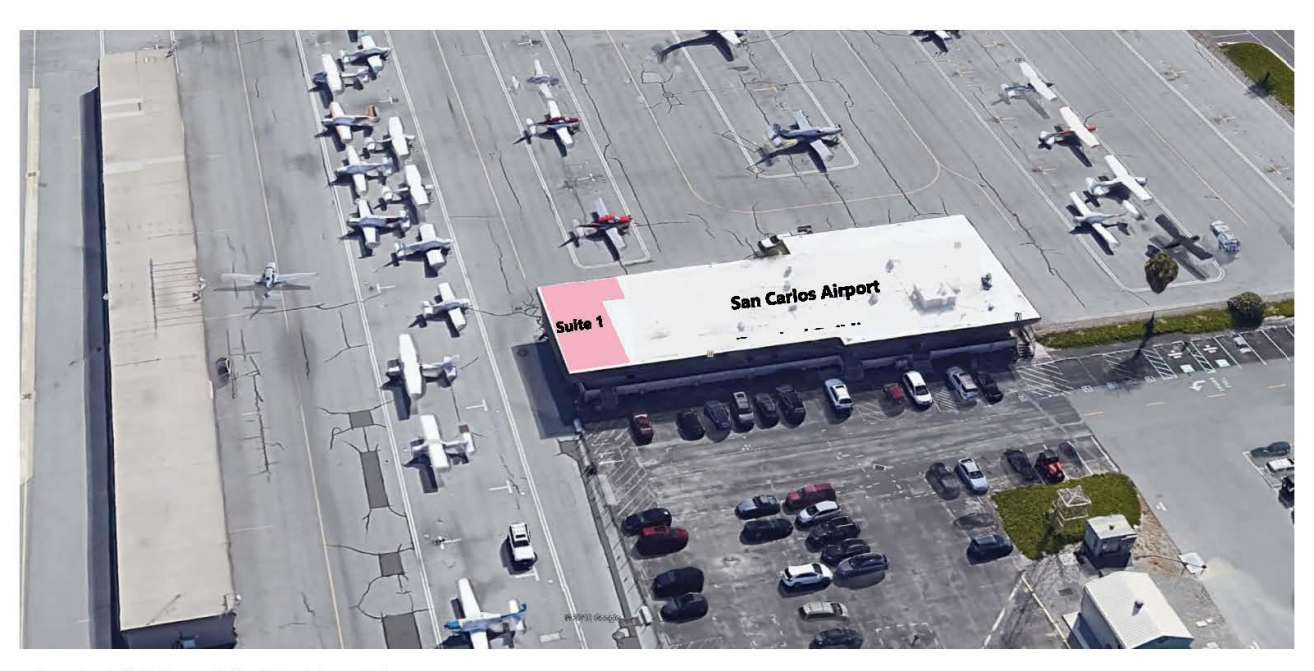
Terminal Building – Suite 1 (not to scale)

San Carlos Airport Terminal Building Suite 1 (835 sq. ft)