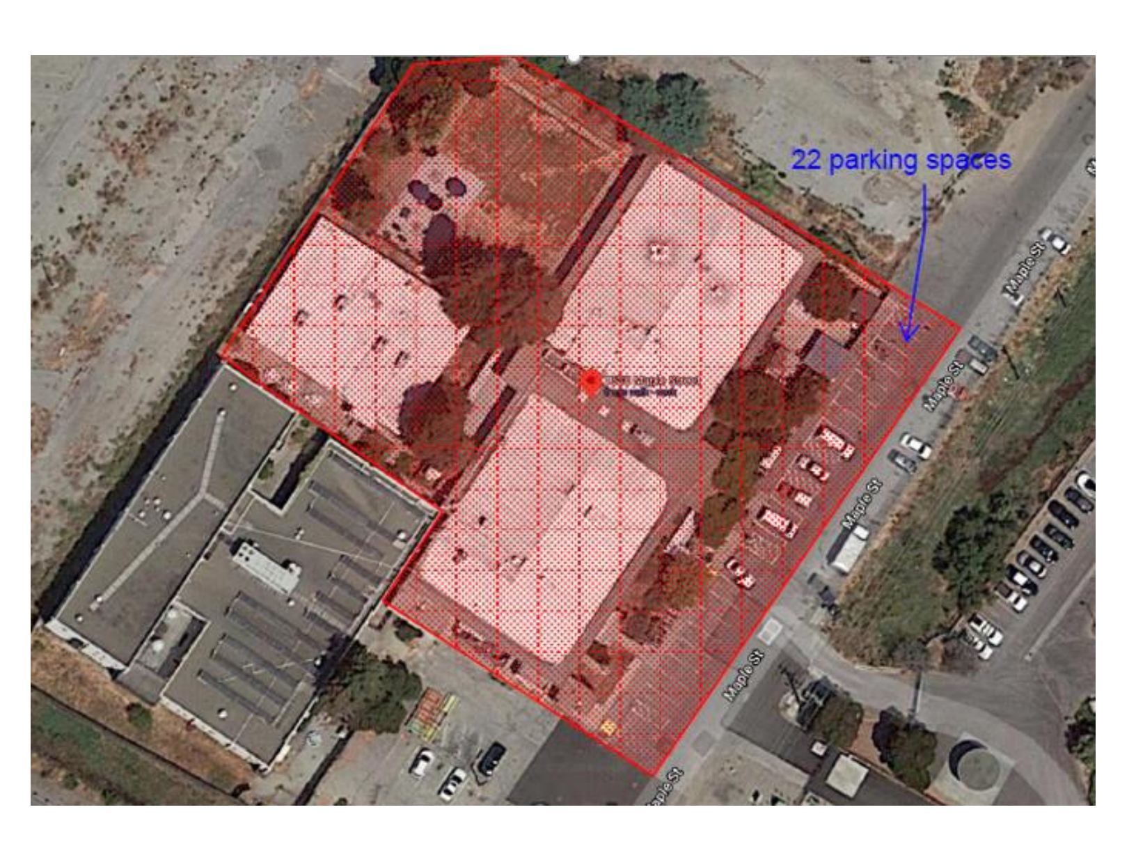
EXHIBIT 1 Diagram of Premises