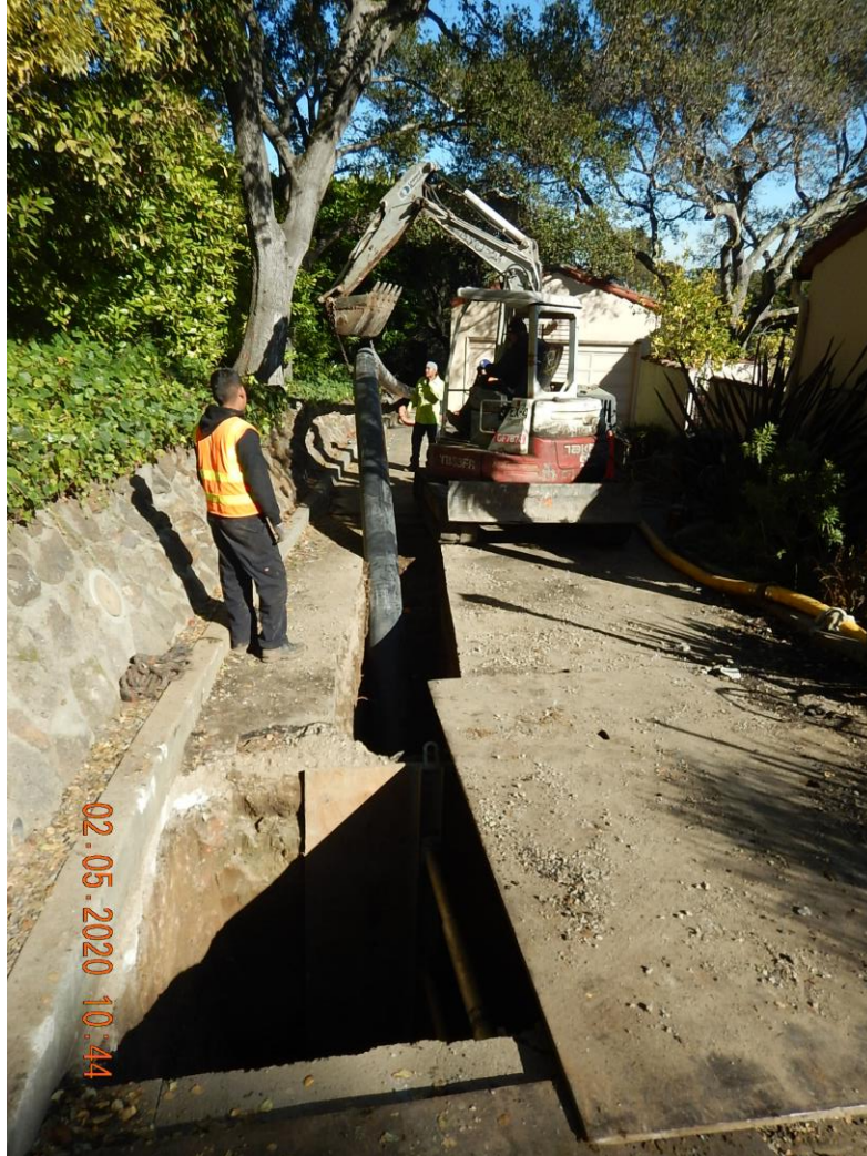
Installing Sewer Pipe in Private Driveway (Easement)