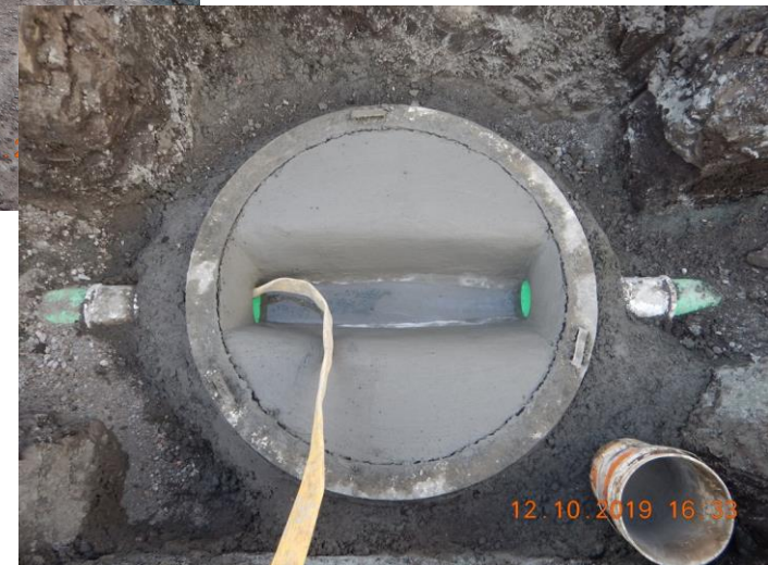
→ Forming Manhole Base