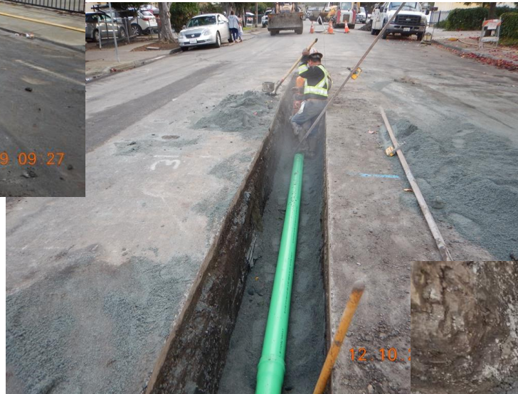
← Pipe Laying