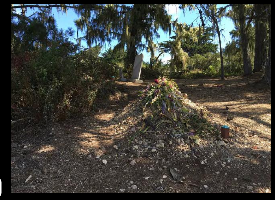
BURIAL SITE - SEPTEMBER 2018