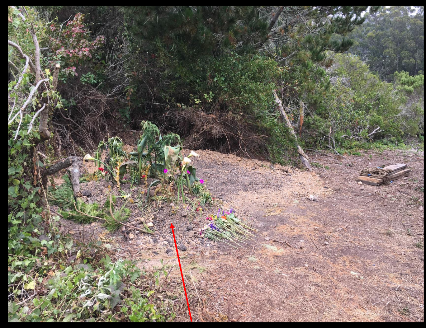
VEGETATION REMOVAL and BURIAL SITE JULY 19, 2018