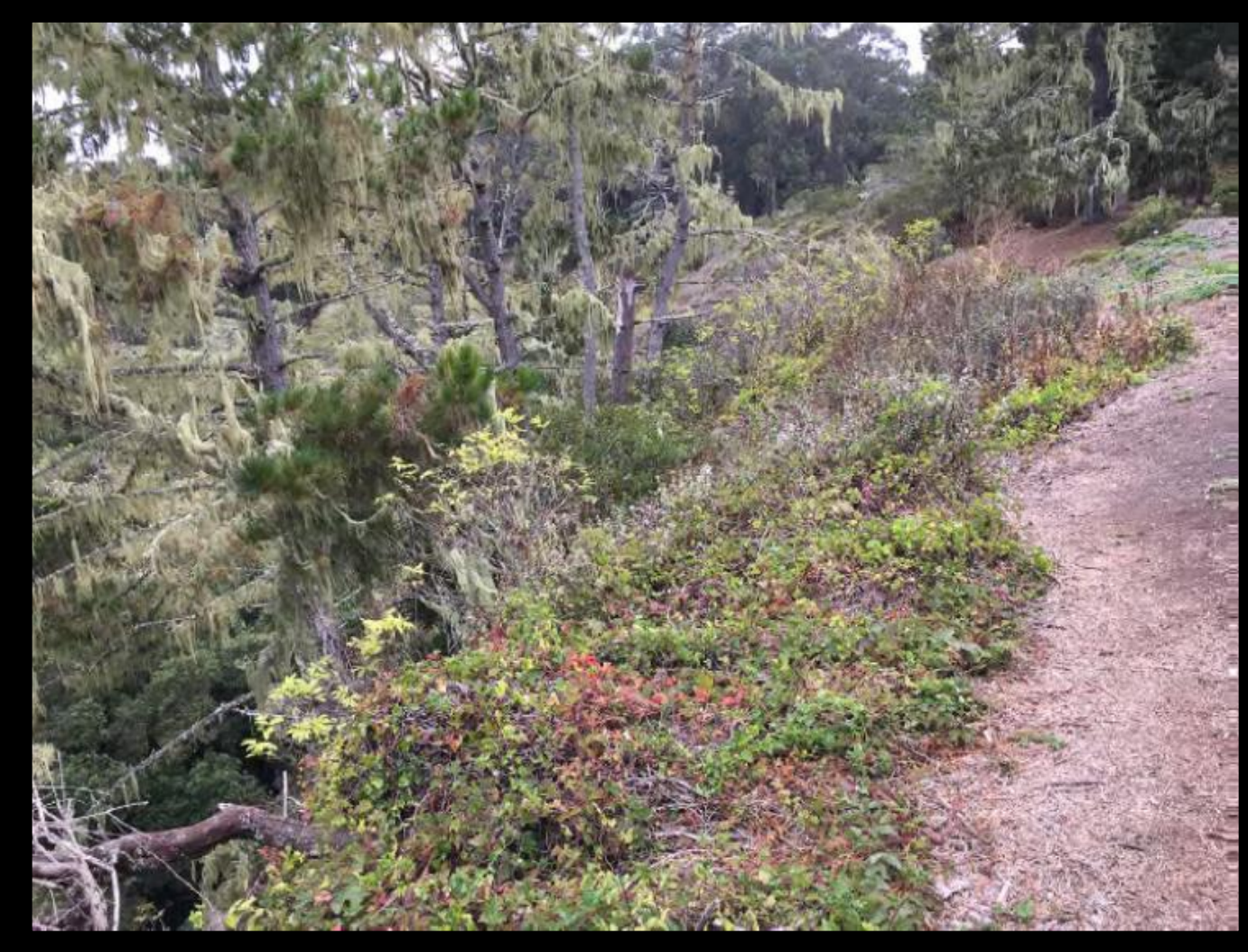
CLEARING ADJACENT TO DROP-OFF TO CREEK