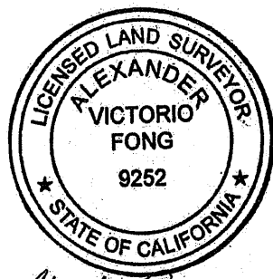
SCALE 1" = 150'