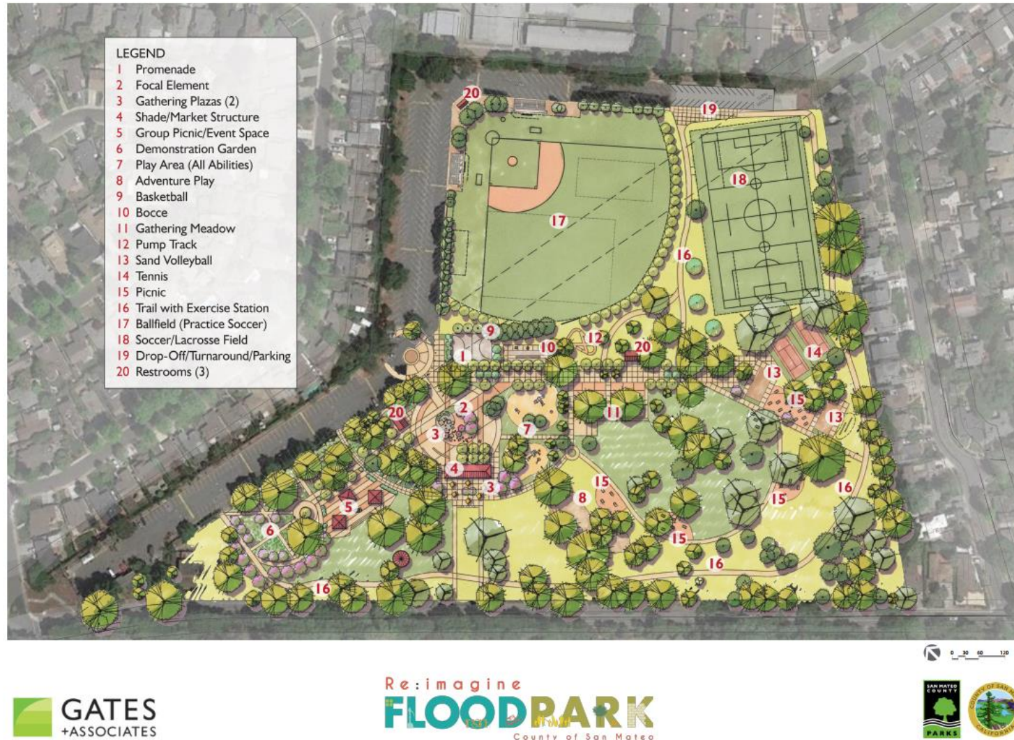
Figure 1 Proposed Landscape Plan