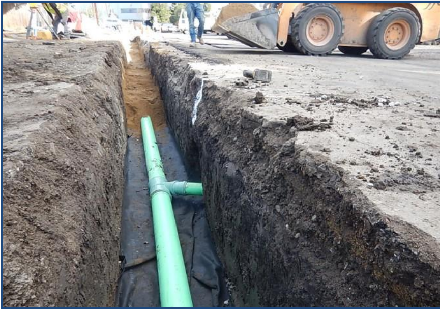
Sewer Pipe Replacement