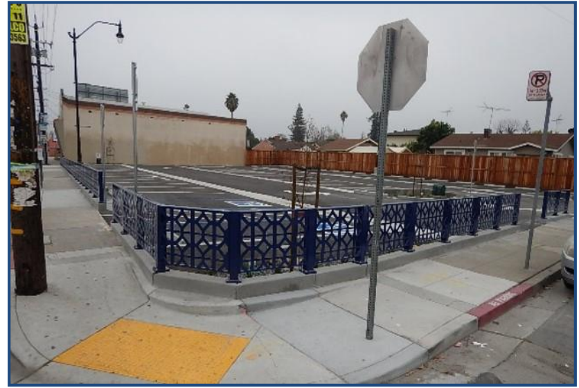
Middlefield Road Parking Lot