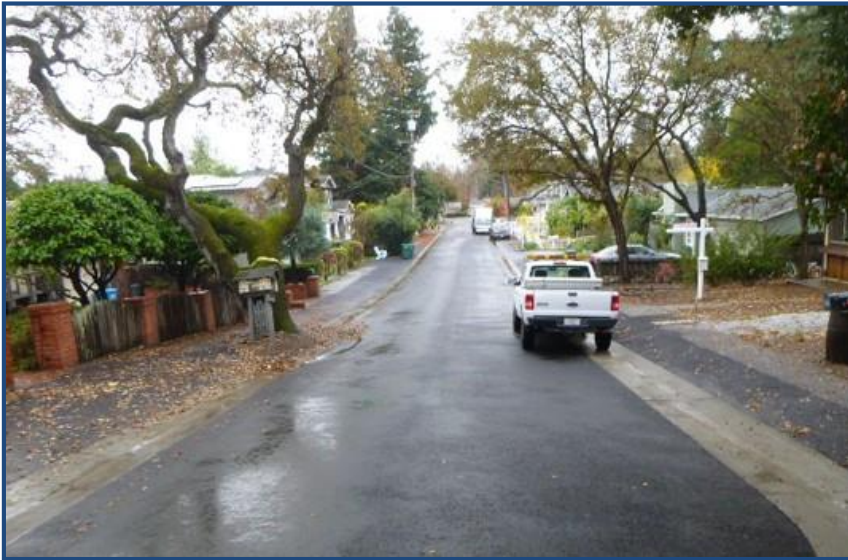
Croner Ave Reconstruction