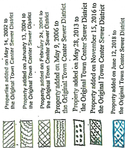
EXHIBIT "A" - TOWN CENTER SEWER ASSESSMENT DISTRICT