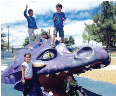
Children enjoying a fun-filled day at Coyote Point Park's Magic Mountain Playground.

County libraries are at the heart of connecting families to their communities. Libraries offer many activities that bring parents and children together to learn, play, be creative and interact with other members of the community.