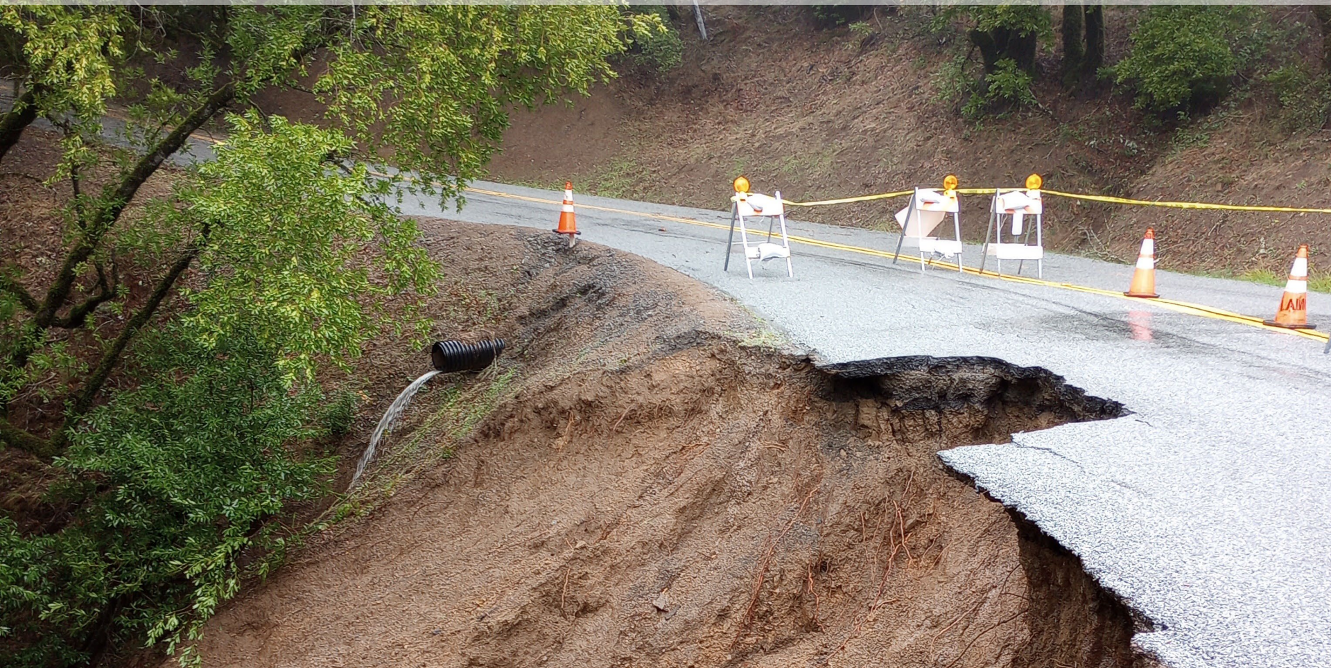
Alpine Road Storm Damage