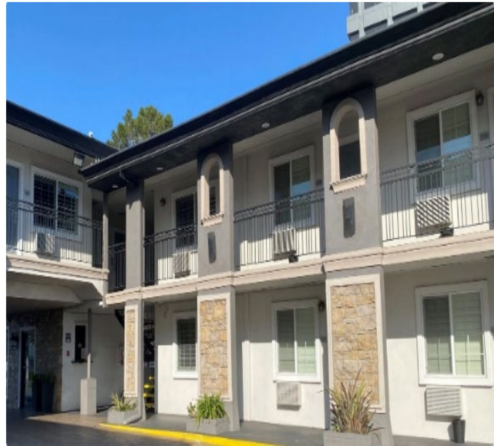
Stone Villa Shelter Renovations San Mateo