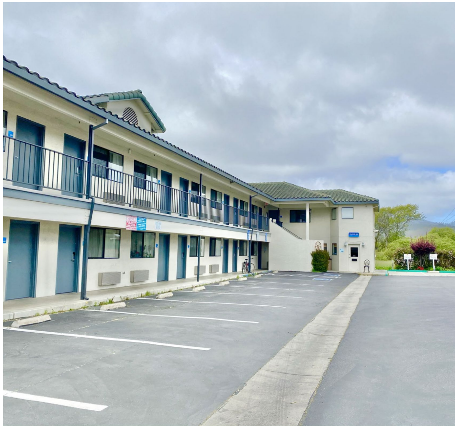
Coast House Shelter Renovations Half Moon Bay