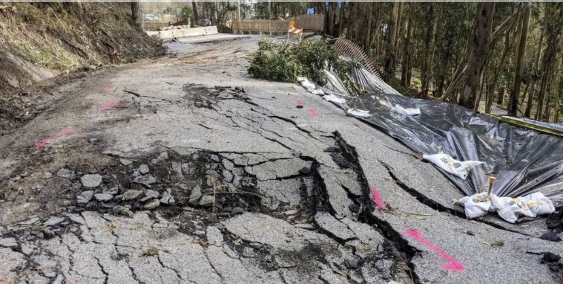
Higgins Canyon Road Storm Damage