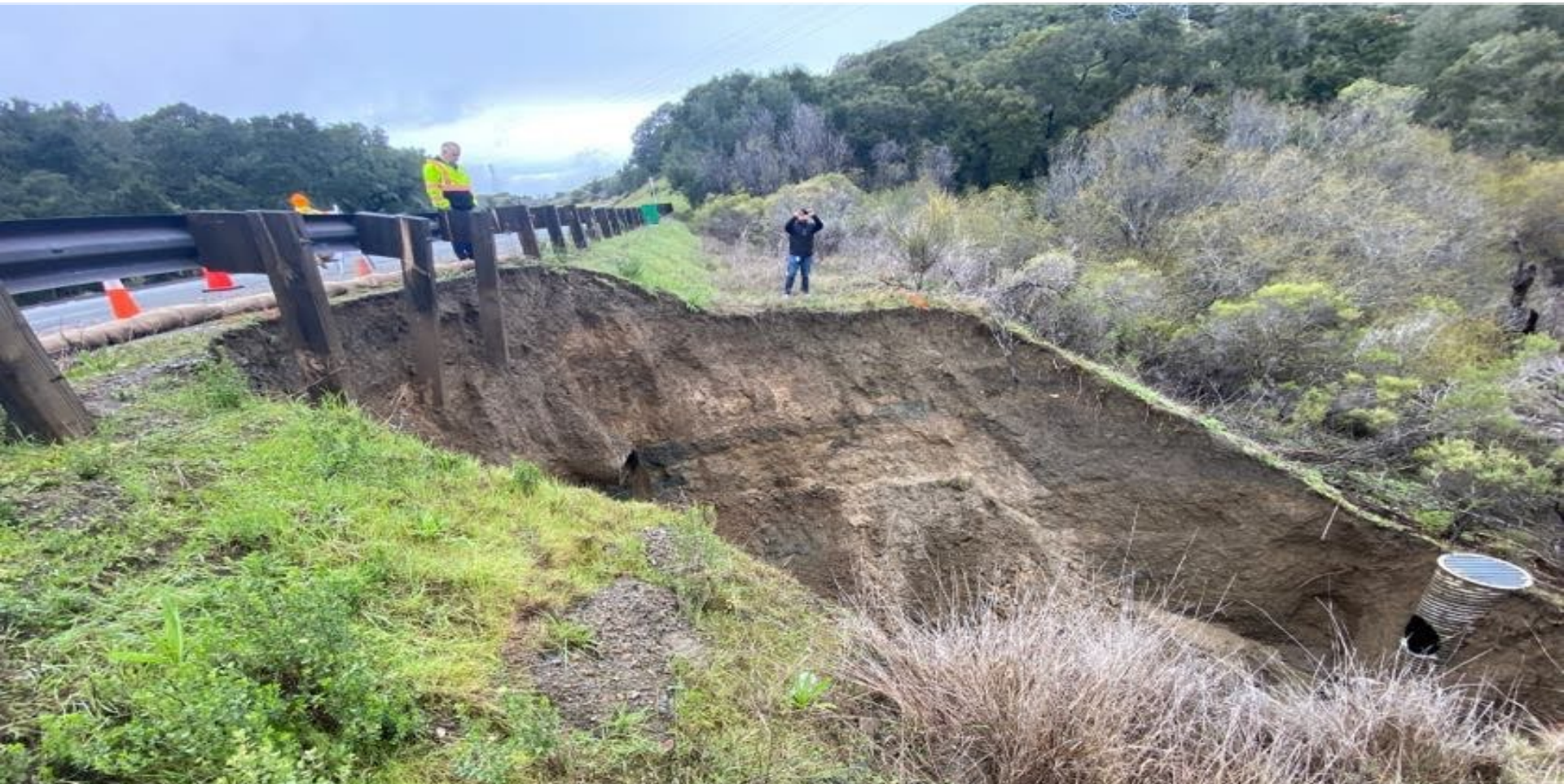
Cañada Road Storm Damage