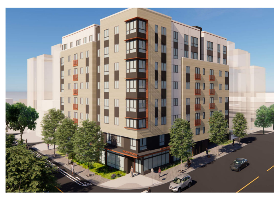
Eucalyptus Grove 69 Units Allied Housing Burlingame, CA

The Department of Housing (DOH) collaborates with partners as a catalyst to increase the supply of affordable housing and create opportunities for people at all income levels and abilities to prosper by supporting livable and thriving communities.