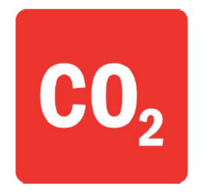
LOW EMBODIED CARBON

On-site photovoltaics offset 100% building operational predicted energy usage.