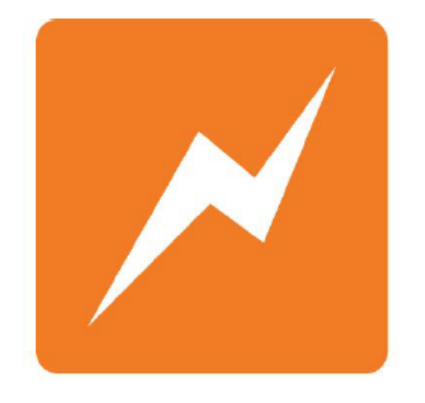
ZERO NET ENERGY

On-site photovoltaics offset 100% building operational predicted energy usage.