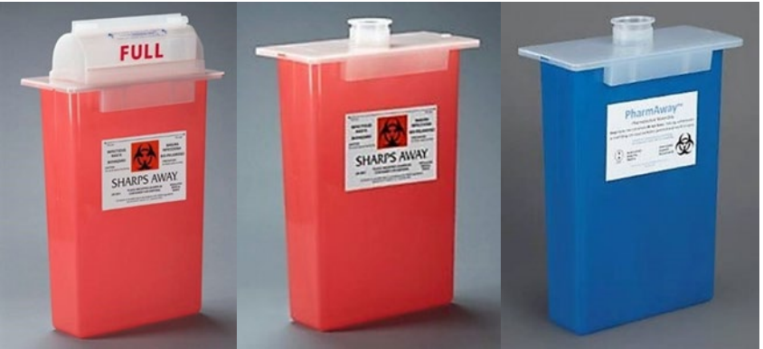
17-Gallon Reusable Containers