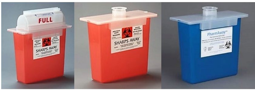
3-Gallon Reusable Containers