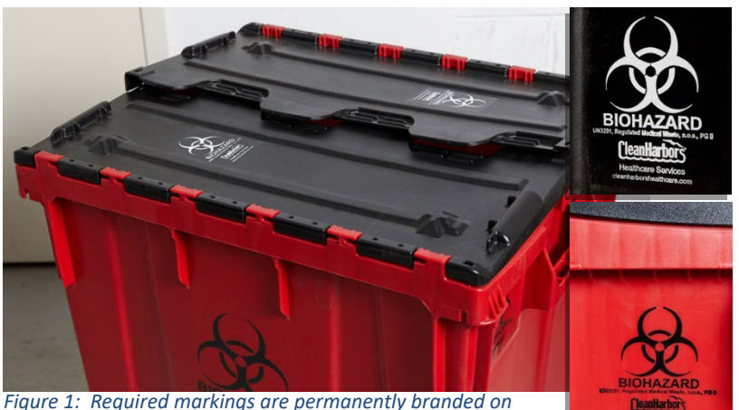
Figure 1: Required markings are permanently branded on Clean Harbor's medical waste tubs. The images on the right are close up views of the tub's lid flaps and narrow sides.

BIOHAZARD Dross Negative Stock Nata, POS LeanHardow Heatman Storics Chanter Storics