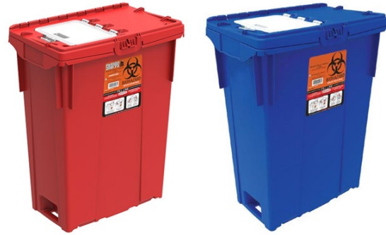
Figure 2: Reusable container sizes and configurations for sharps and pharmaceutical wastes. Although not shown, Contractor do offer horizontal drop lid configurations for 2- and 3-gallon blue pharmaceutical waste containers too.

3. Emergency Requests for Reusable Containers