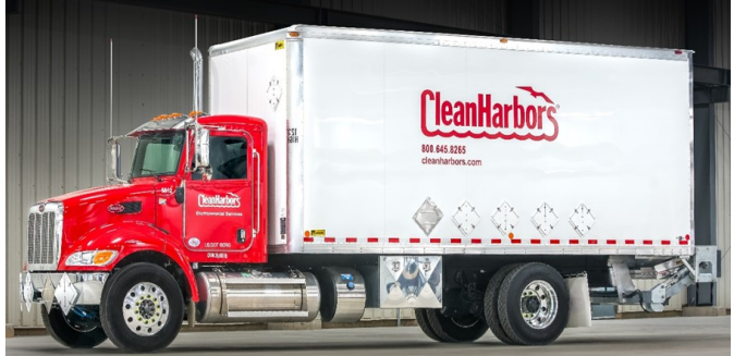
Figure 5: Contractor will use a box truck with liftgate to pick-up medical wastes from County facilities.

With a fleet of more than 17,000 company-owned and operated transportation vehicles, Contractor is ranked as one of the top twenty largest private carriers in North America.