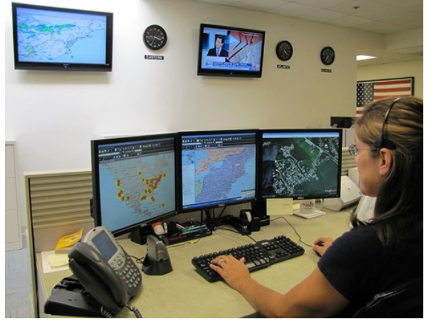
Figure 6: A Clean Harbors' EOC duty officer at a workstation.

The EOC is staffed <u>live</u>, twenty-four hours a day, seven days a week by DOT and RCRA-trained duty operators. This offers the County unmatched coordination and control of clean-up efforts, ensuring a timely response to your emergency needs.