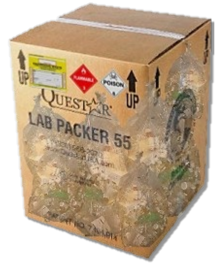
Figure 4: Sealed 55-gal copack box. (image partially transparent to show full liners inside)

By using liners, the County will only need to purchase a few collection bins periodically to replace any that wear out or that cannot be reused due to the presence of sharps, blood and/or free liquids.