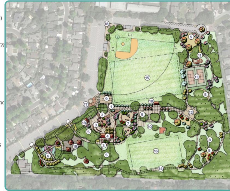
2020 Landscape Plan | Plan de Paisaje de 2020

¡CAPACIDADES AVENTURERO JL TRO BICICLETAS PUMP TRACK LEIBOL DE ARENA TENIS/PICKLEBALL ATION CIÓN DE EJERCICIO USE SPORT FIELD CAMPO DE USOS MÚLTIPLES FIELD IVA DE USOS MÚLTIPLES EA DE ENTREGA BAÑOS VABLE PICNIC AREA E DE PICNIC RESERVABLE CNIC SITES ARE INCLUDED BUT NOT SHOWN 20 SITIOS DE PICNIC, PERO NO SE MUESTRAN