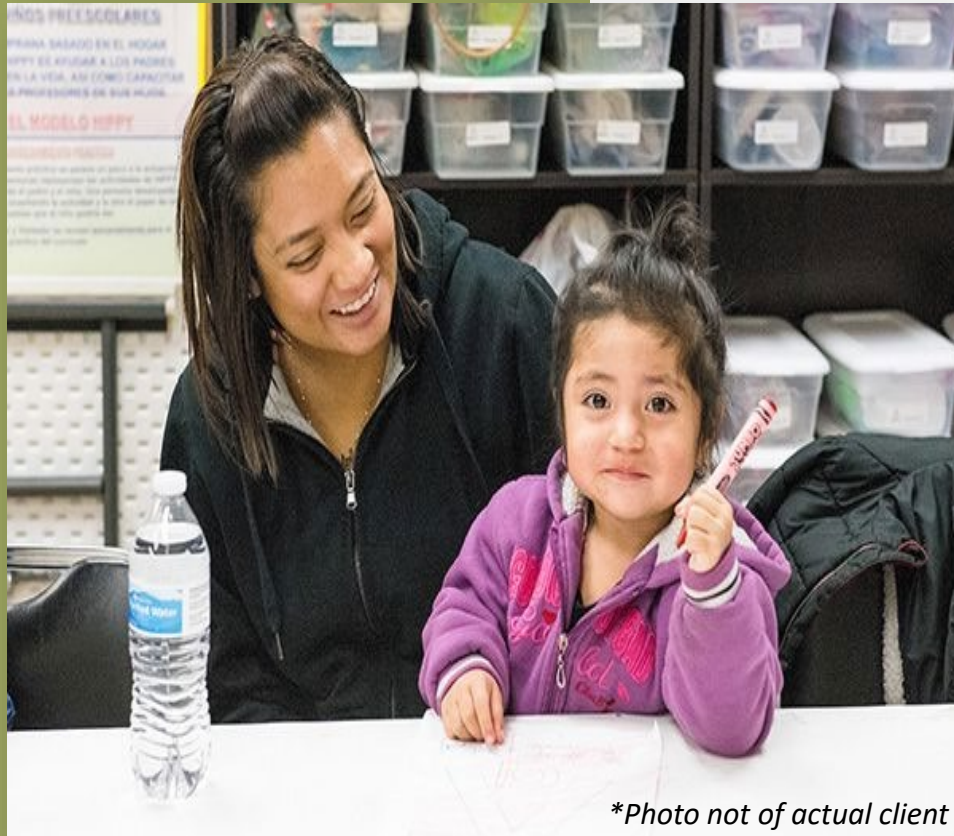
*Photo not of actual client

“CALL Primrose met her immediate needs while building trust and connection.”