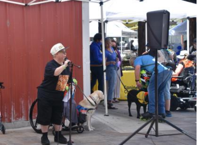
August 11 th, 2022