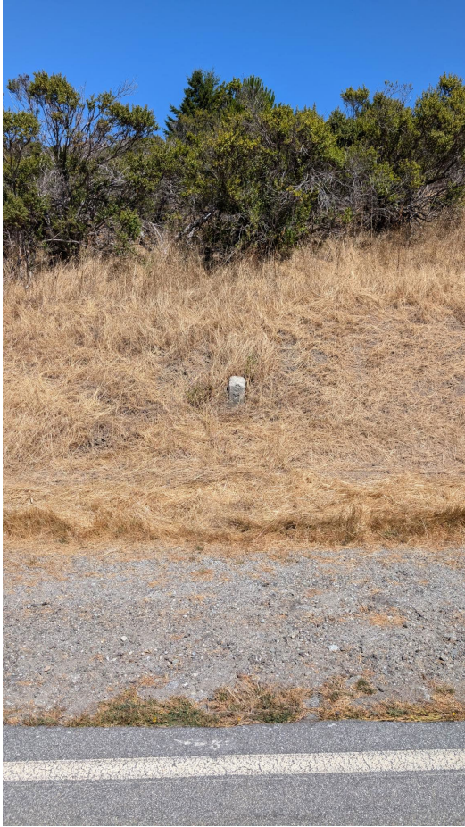
Monument on side of the road