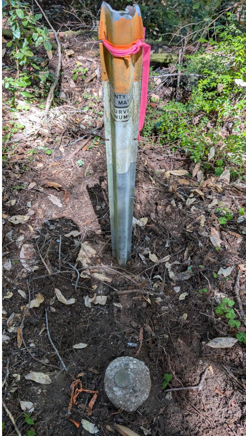
Metal stake to help identify monument