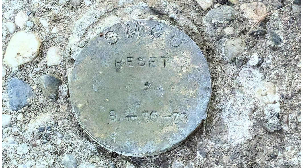
Survey marker dated Sept. 30, 1970