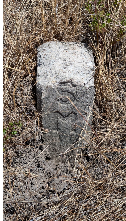
Close up of monument