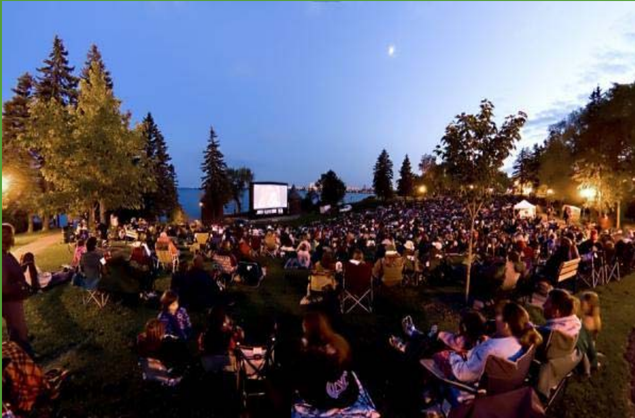
Movie Night at Coyote Point Park