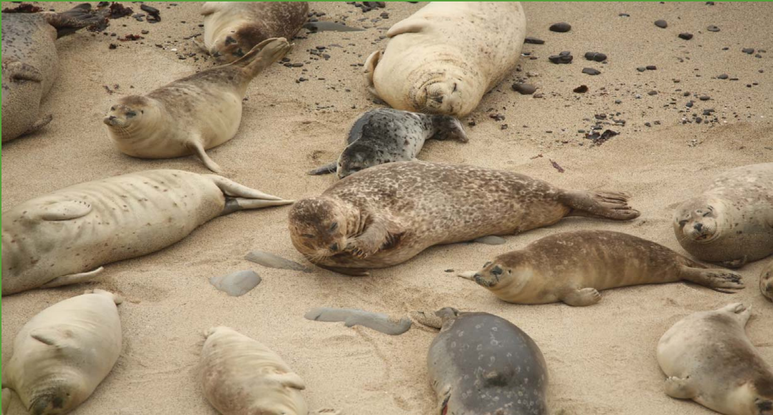
68 Harbor Seal Pups Born at Fitzgerald Marine Reserve