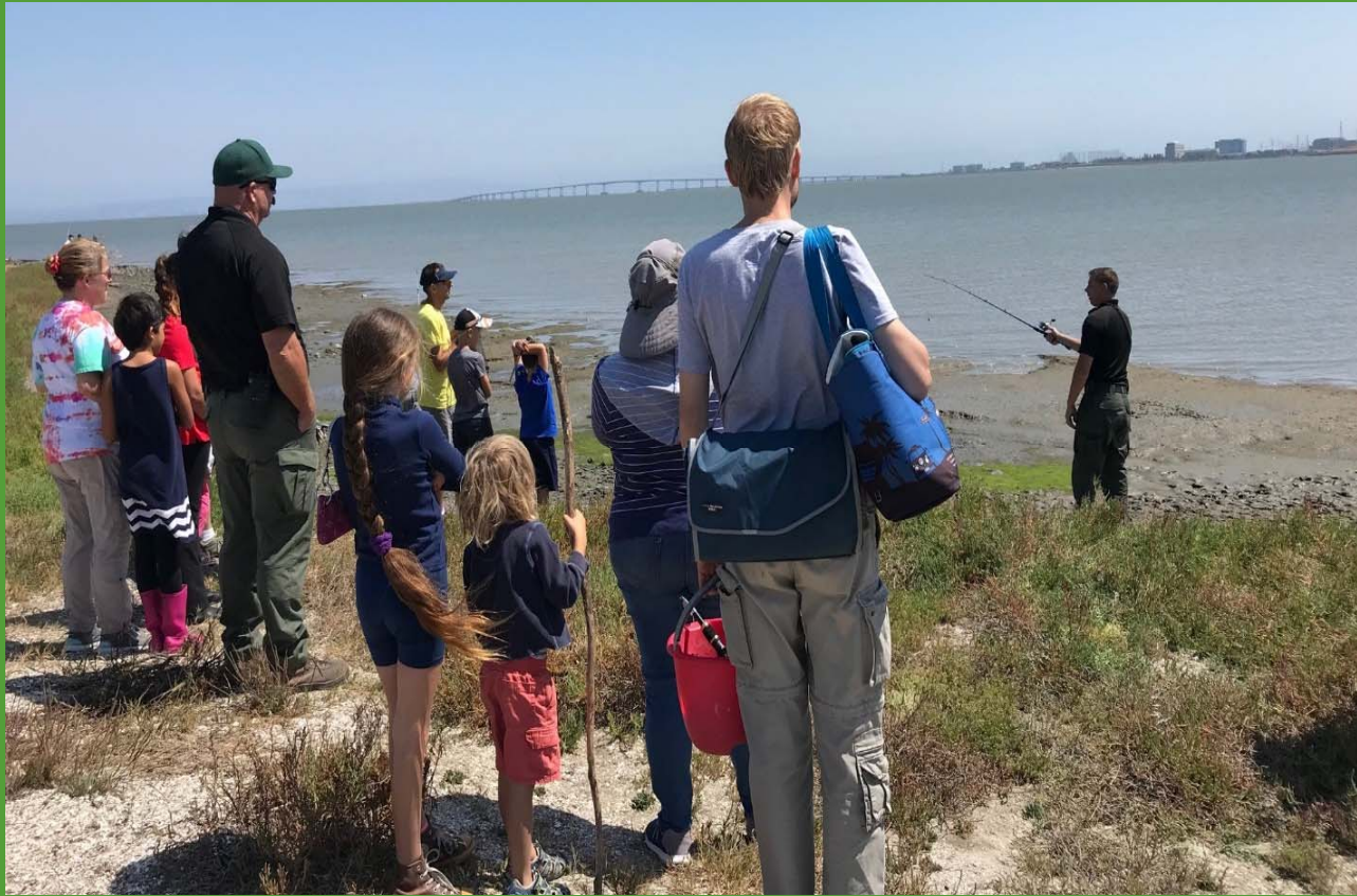
Fishing with a Ranger at Coyote Point Park