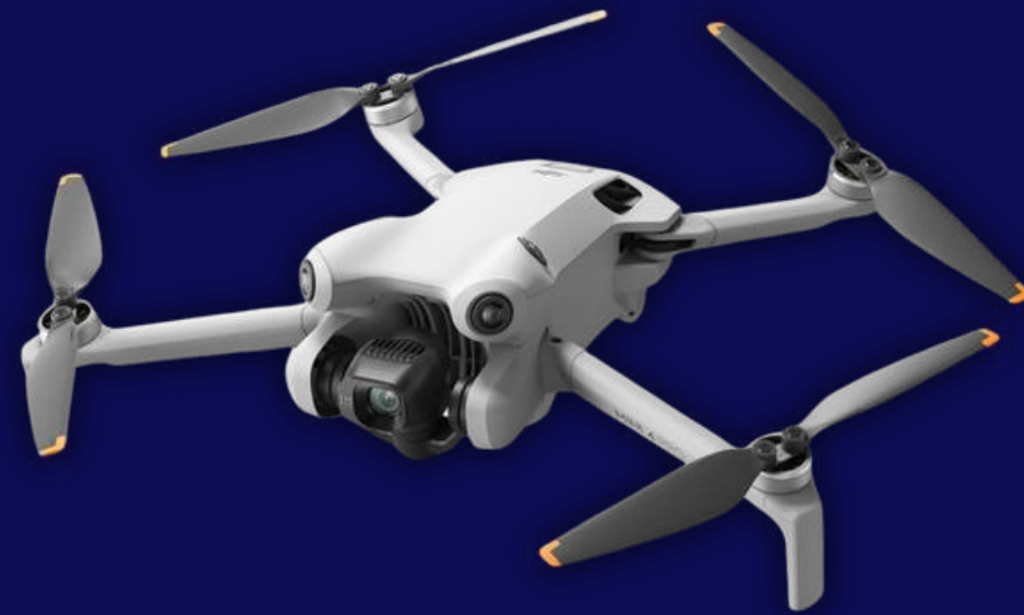
(2) DJI Mini 4