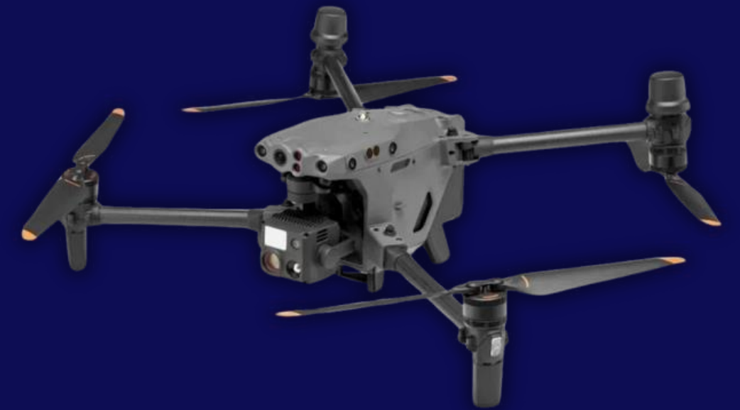
2) DJI M30T