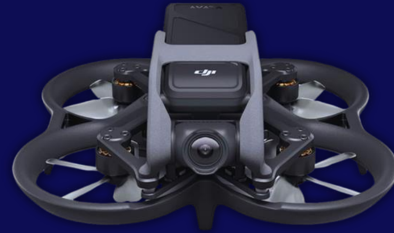
(2) DJI Avata