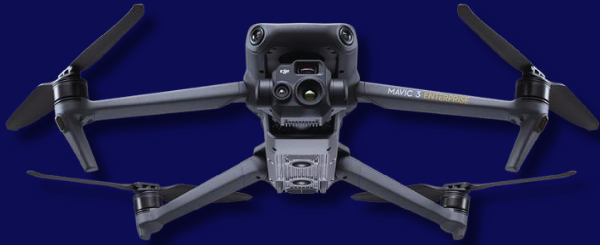
(4) DJI Mavic 3 Enterprise/Thermal