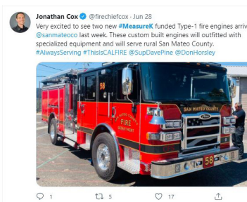
San Mateo County Fire welcomes a new custom-built engine on social media.