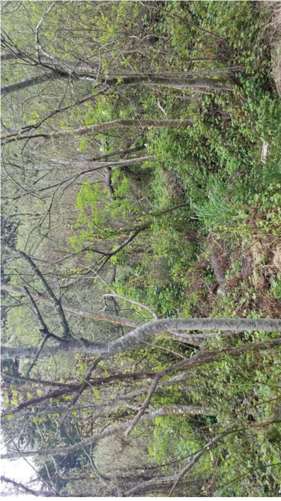
Riparian vegetation to the east of the project parcel