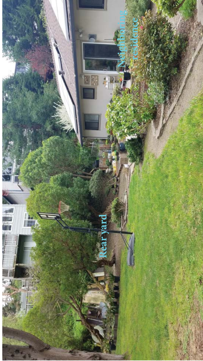
Project parcel developed with garden beds and ornamental vegetation