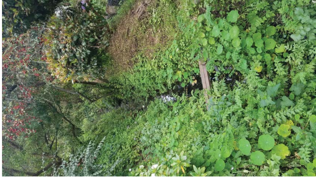
Dean Creek bisecting front of parcel