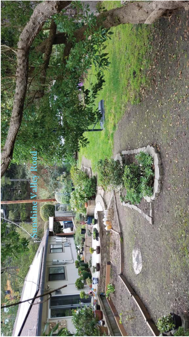
Looking towards Sunshine Valley Road