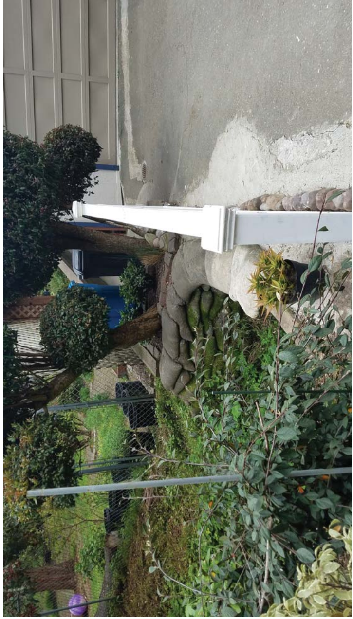
Dean Creek culverted under neighboring driveway