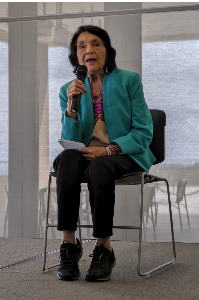
American labor leader and civil rights activist, Dolores Huerta, speaks at the RISE Women's Leadership Conference.