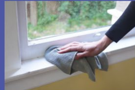
in house dust