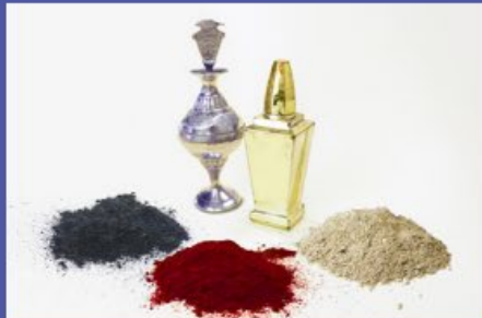
in traditional makeup, like kohl, surma, or sindoor