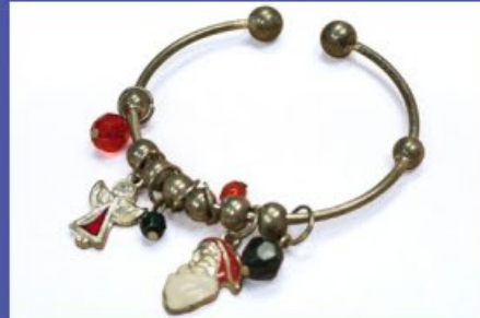
in some jewelry

https://dtsc.ca.gov/toxics-in-products/lead-in-jewelry/