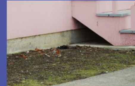
in bare dirt

www.cdph.ca.gov/Programs/CEH/DFDCS/Pages/FDBPrograms/FoodSafetyProgram/LeadInCandy.aspx