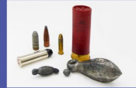
in bullets and fishing sinkers