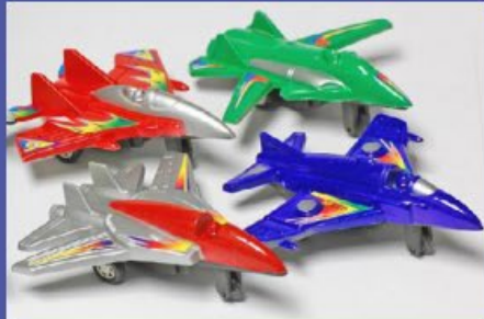
in some toys