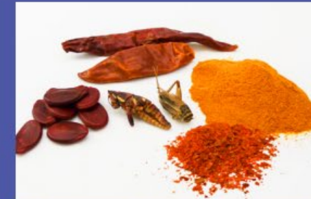
in foods and brightly-colored spices from outside the USA