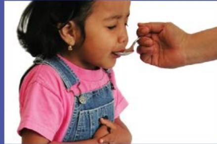
in remedies like azarcon, greta, or pay-loo-ah