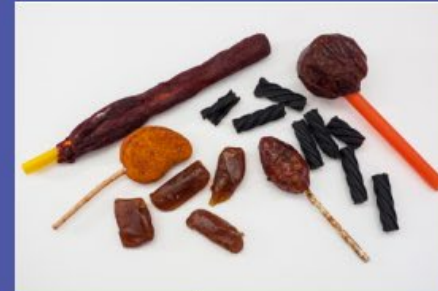
in some candies

https://dtsc.ca.gov/toxics-in-products/lead-in-jewelry/