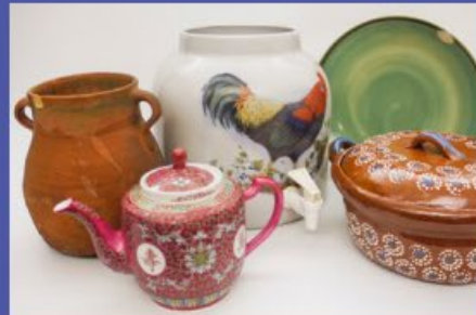
in some dishes and pots