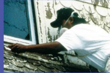
on your hair, skin, shoes, and clothes after work