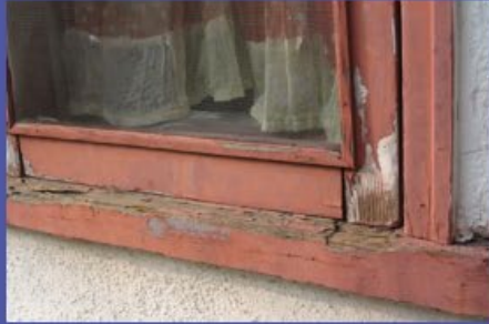
in chipping paint