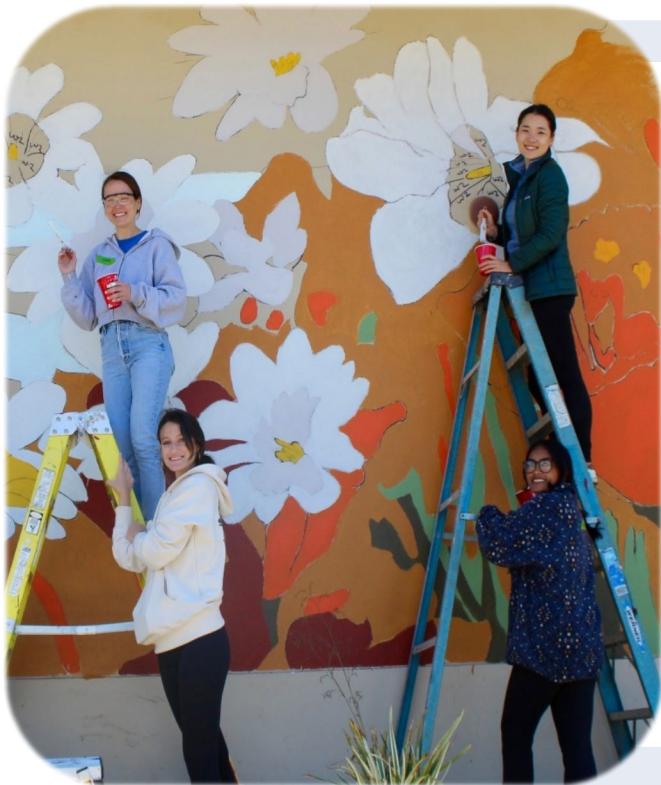
Rebuilding Together Peninsula