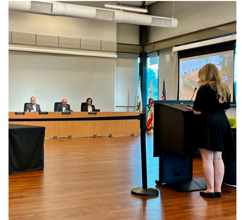
Local, State, and National Advocacy