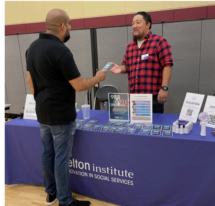
Community Trainings and Outreach