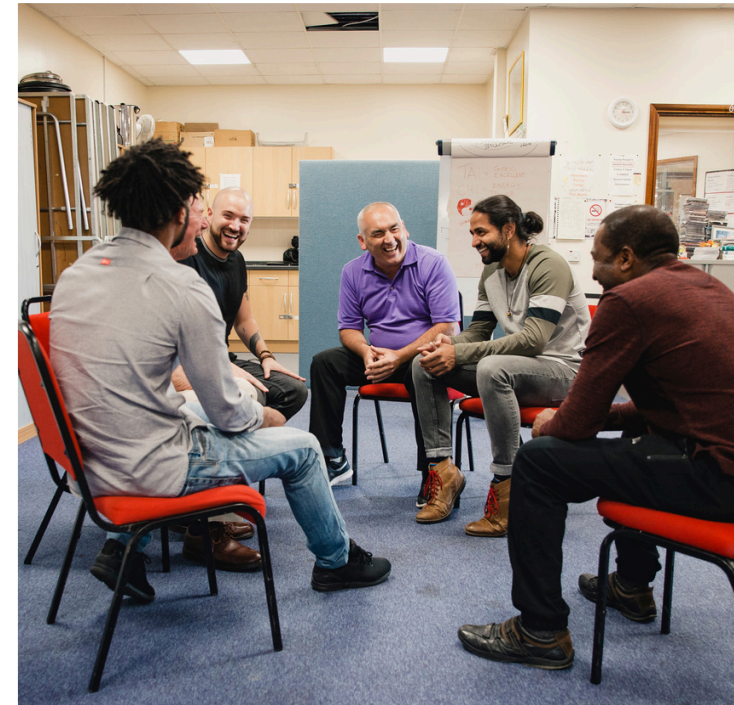
Suicide Loss Team