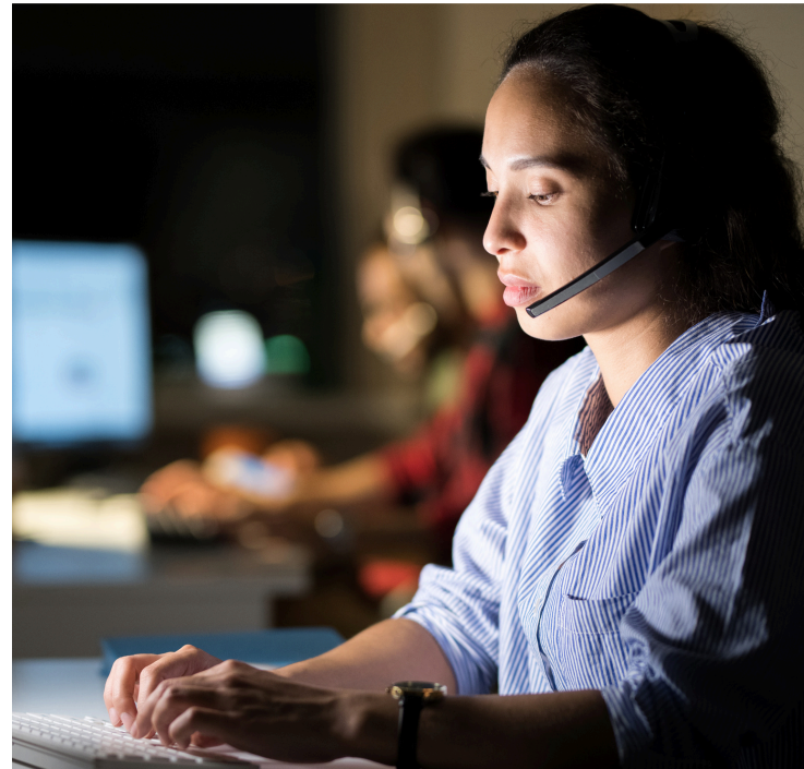
988 Suicide and Crisis Lifeline

Suicide Prevention for San Mateo County since 1966