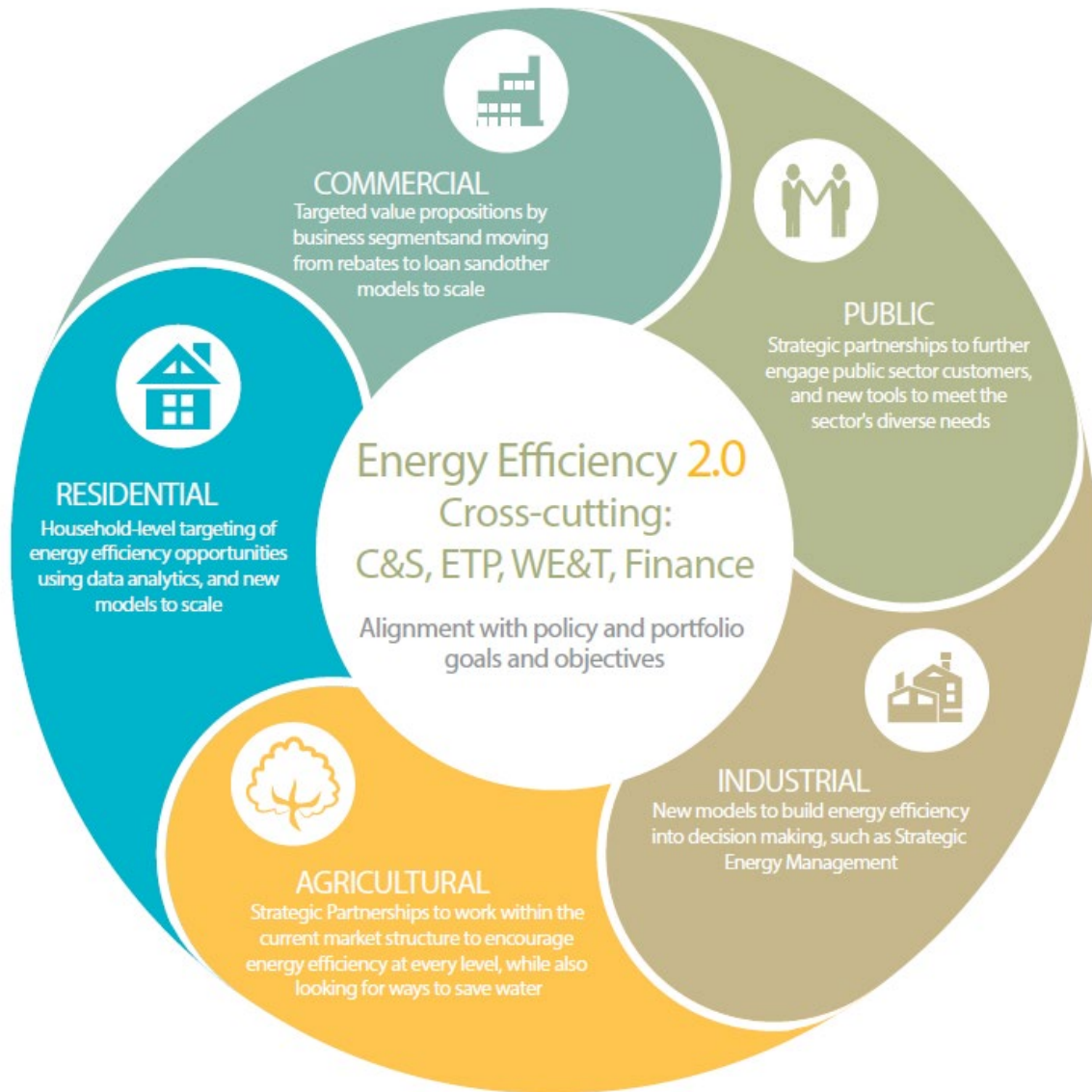
Figure 1.2 – PG&E's EE Revised Portfolio Focus Areas.

As PG&E transitions to a fully 3P Implementer supported EE portfolio that includes 3P EE Programs and Local Government Partnership (LGP) Programs, PG&E's role will evolve to that of a Portfolio Administrator (PA), and the role of 3P Implementers implementing LGP Programs will also evolve beyond the scope observed today. Figure 1.3 – 3P Implementer Roles in EE Programs that include LGP Programs provides a simple depiction of these changing roles for both PG&E and 3P EE Implementers.