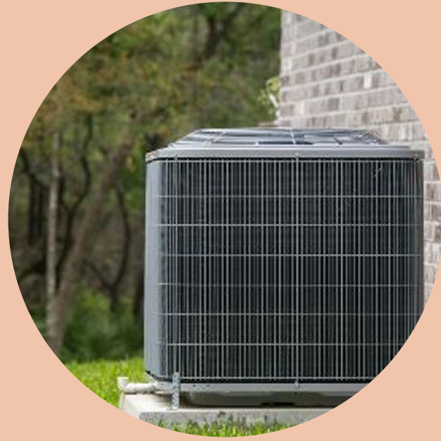
Space heating/ cooling