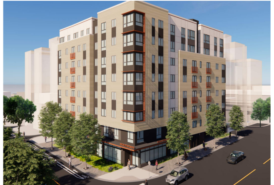
Eucalyptus Grove 69 Units Allied Housing Burlingame, CA

The Department of Housing (DOH) collaborates with partners as a catalyst to increase the supply of affordable housing and create opportunities for people at all income levels and abilities to prosper by supporting livable and thriving communities.