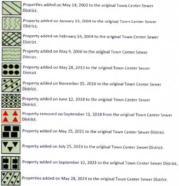
EXHIBIT "A" - TOWN CENTER SEWER ASSESSMENT DISTRICT