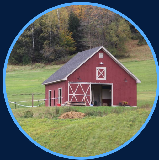
Farms/ Ranches (62)