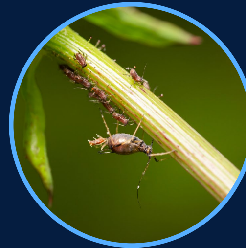
Outdoor Pest Control Businesses (158)