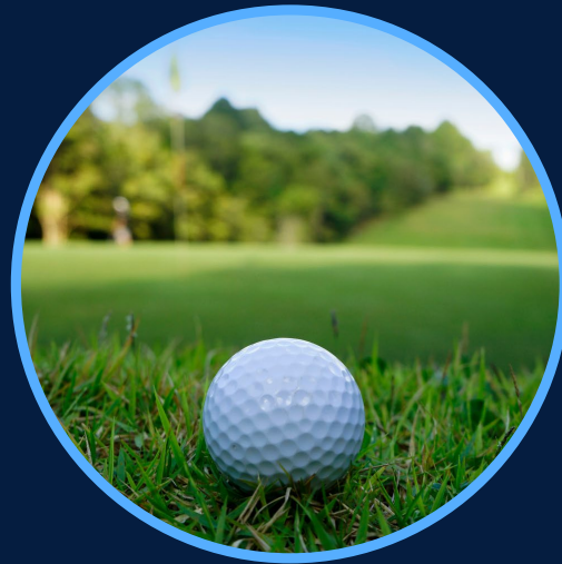
Land Managers (56)