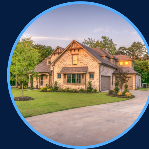
Structural Pest Control Businesses (195)