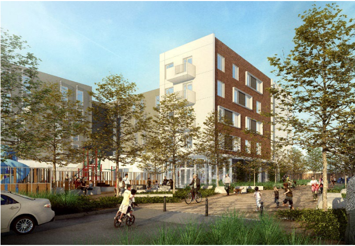
Middlefield Junction Childcare Center