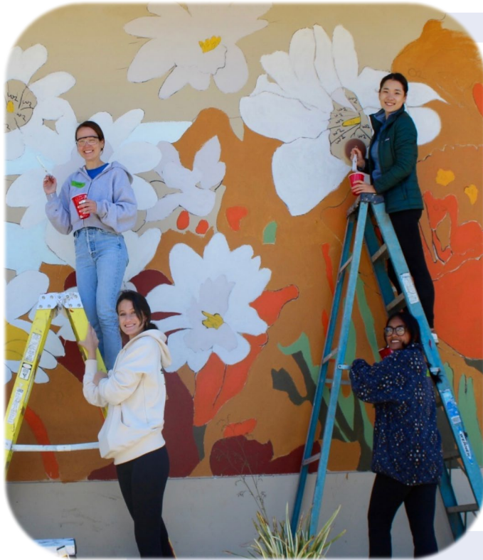
Rebuilding Together Peninsula