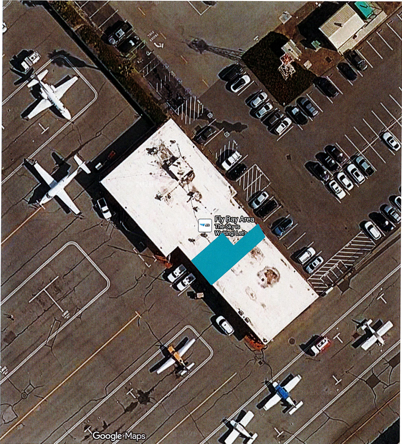
EXHIBIT A SITE PLAN OF PREMISES San Carlos Airport Terminal Building Suite 7