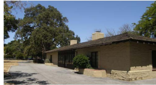
Flood County Park Landscape Plan

Final Revised Environmental Impact Report/ Response to Comments Document