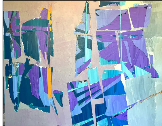
Artwork Titled "Pacific 4 XL" by Jamesey